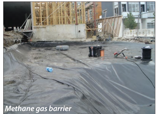
Methane gas barrier

Testing at 20 degrees Celcius (+/- 2 degrees), at an exposure of 15000 mm2 per litre.